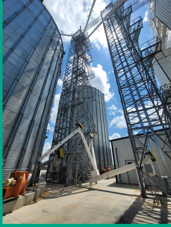
Farmac Industries | June 21, 2024 | Canyon, Texas