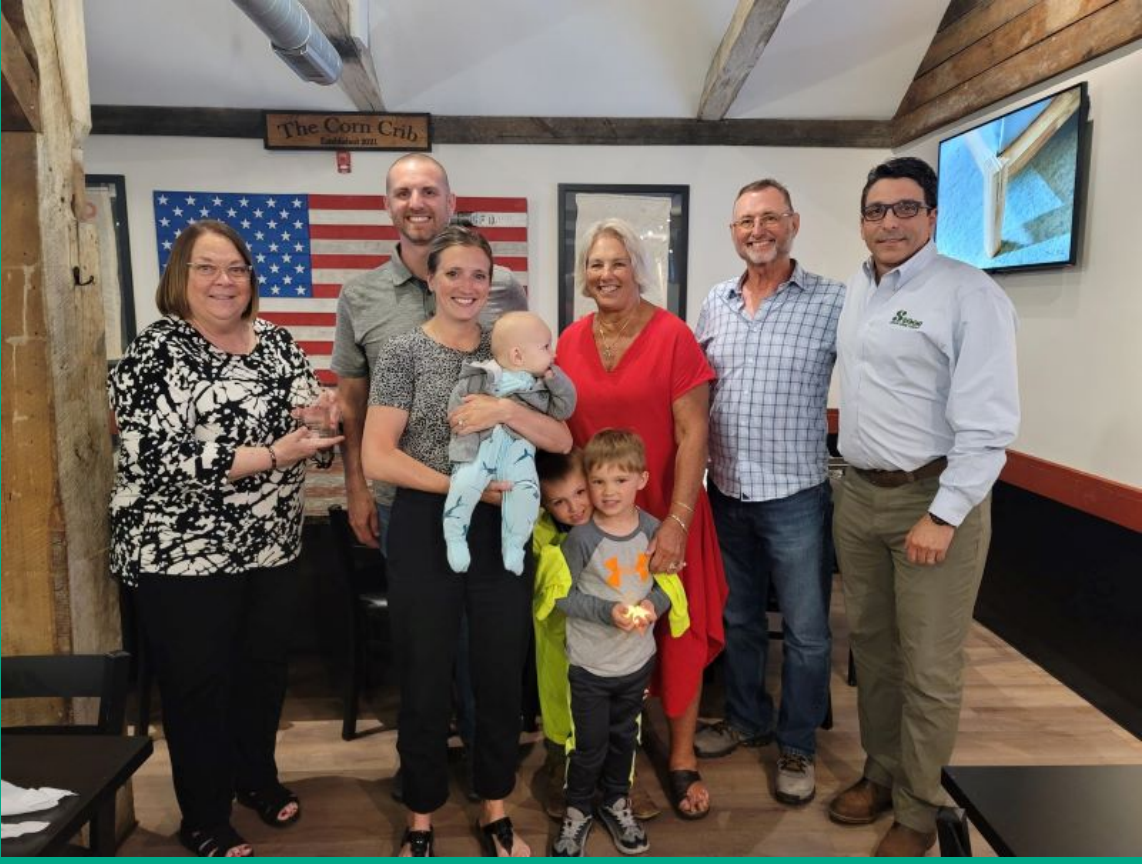
K&S Millwrights | May 17, 2024 | Johnstown, Ohio